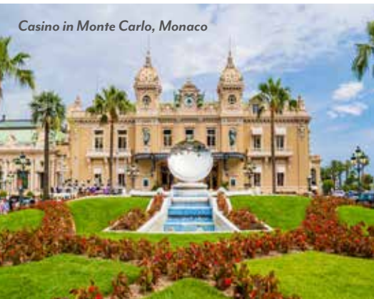
Casino in Monte Carlo, Monaco