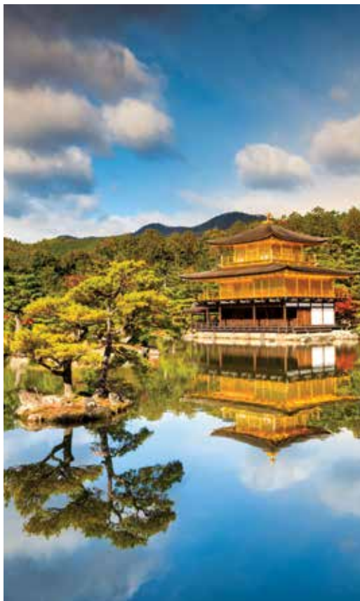
We visit Kyoto’s Temple of the Golden Pavilion on Day 10.