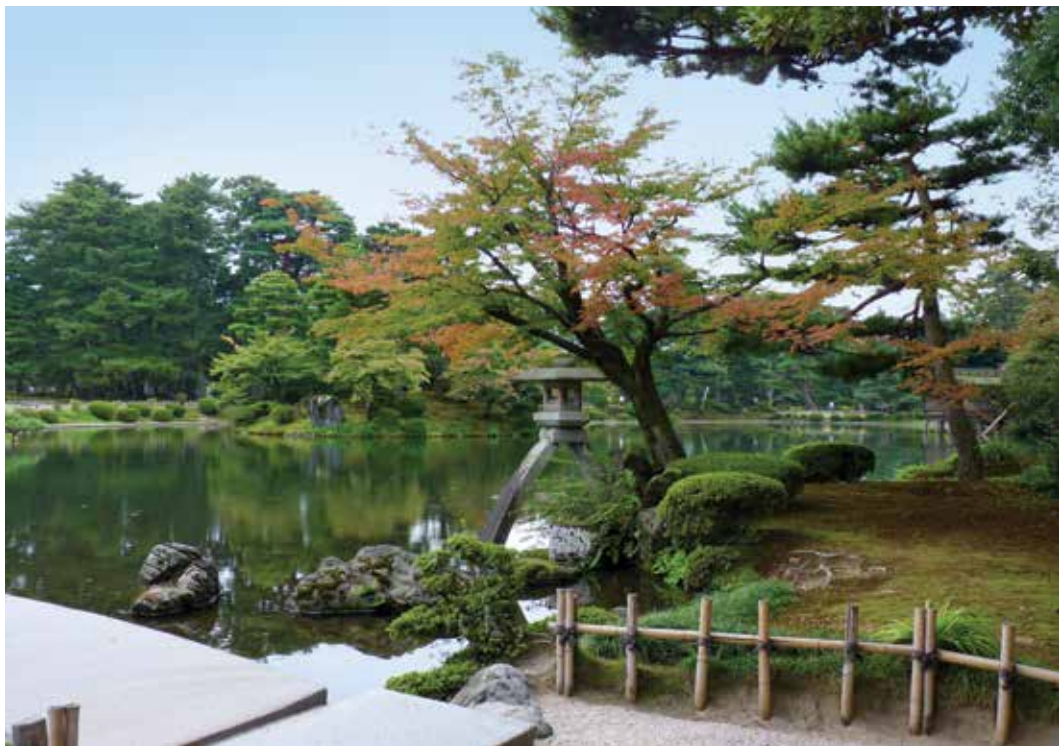
On Day 9 we visit Kenrokuen Garden, one of Japan's finest traditional gardens.

Day 6: Hakone/Takayama Today we travel first by bullet train then by Wide View Hida express train to lovely Takayama in the Japanese Alps, considered one of the country's most attractive towns with its beautifully preserved Old Town. Our explorations center on three narrow streets in the San-machi-suji district where, in feudal times, merchants lived amidst the authentically preserved small inns, teahouses, and sake breweries. This afternoon we attend a traditional Japanese tea ceremony here, an historic ritual of form, grace, and spirituality. B,D