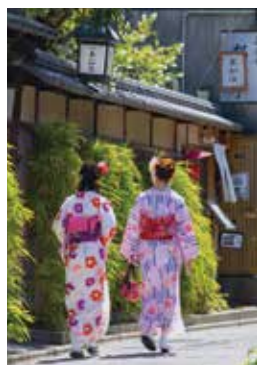
Geishas in traditional dress

Day 11: Kyoto More of Kyoto is on tap today, beginning with a visit to the otherworldly Arashiyama Bamboo Grove; the Kyoto Museum of Traditional Crafts (Fureaikan), showcasing all of Kyoto’s 74 different métiers in one place; and Nijo-jo Castle (c. 1603), the extravagant residence and fortifications of the shoguns who ruled Japan for more than 250 years. Then the remainder of the day is free for independent exploration in this traditional, yet modern city before we gather for dinner together tonight. B,D