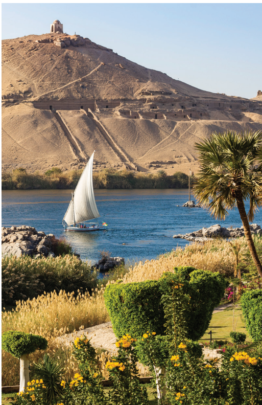
We sail traditional feluccas along the Nile.

Day 15: Depart for U.S. Very early this morning we transfer to the airport for our return flight to the U.S. B