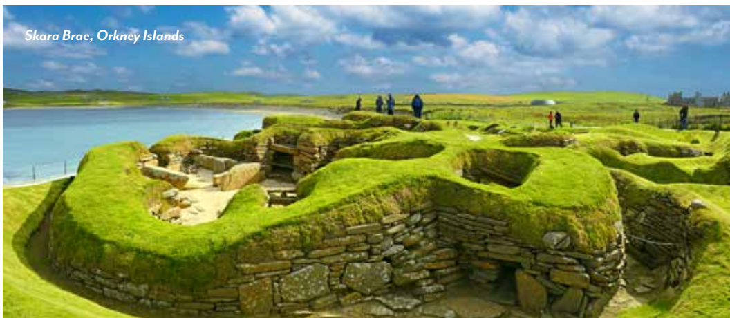
Skara Brae, Orkney Islands

Following breakfast, continue on the Post-Program Option or transfer to the airport for your return flight home. (D)